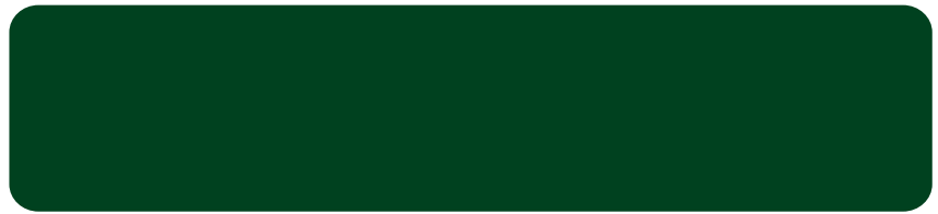
Garden Route Green